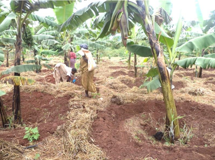
Mothers in their group banana garden working hard to be successful by God's grace.