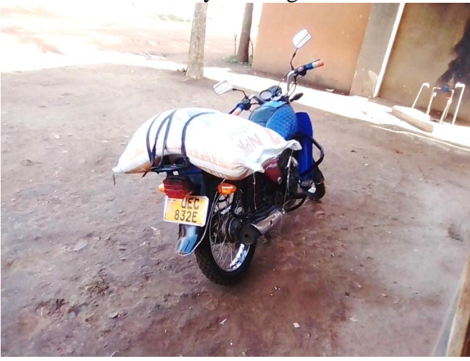
Some of the manure bought for 3 groups in banana farming