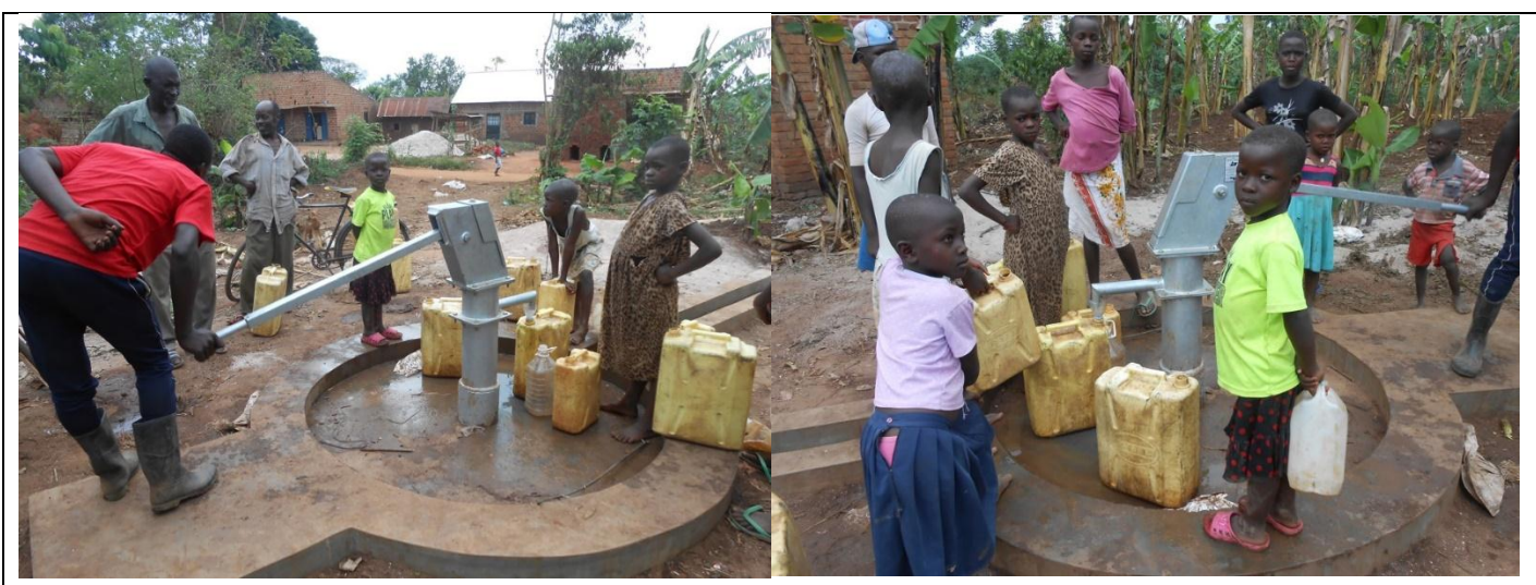
Left to Right, Community accessing water from the newly constructed borehole BELOW IS REPAIRING BROKEN BOREHOLE AT KIJJO.