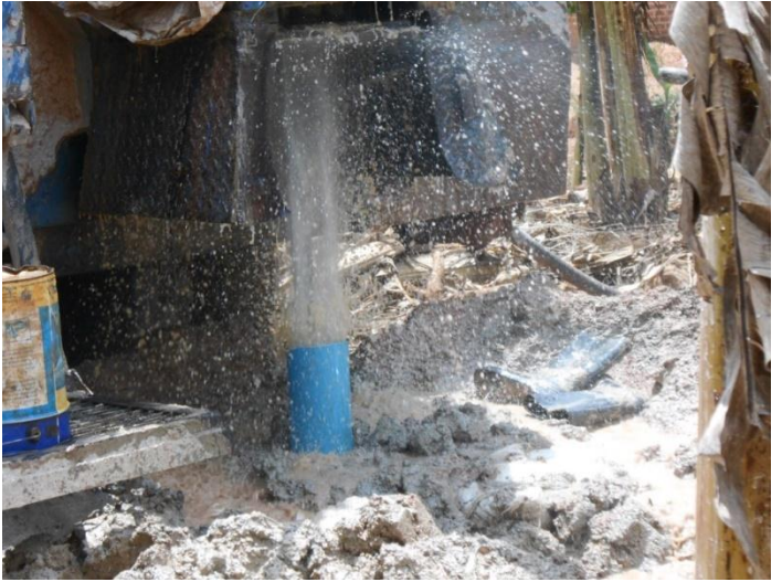
On left the vehicle drilling water while on right now tasting drilled water volume