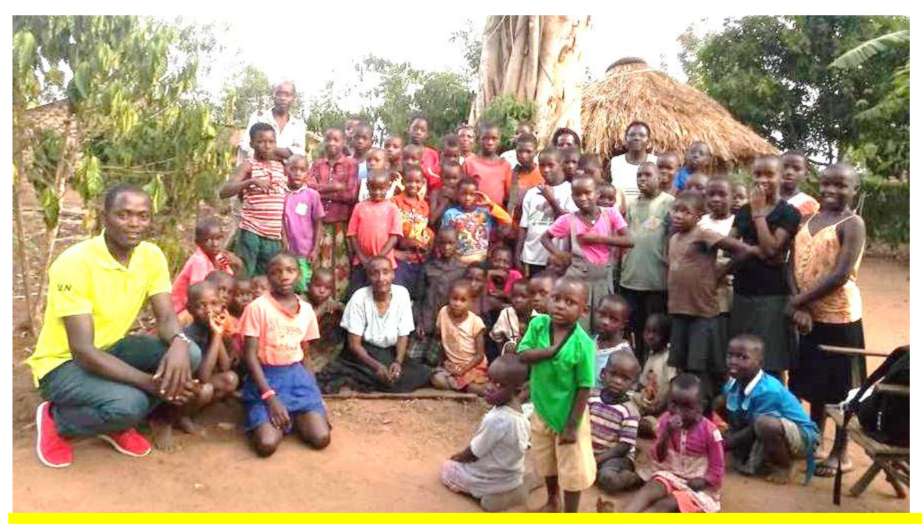
Some of the Sponsored Children

The department has managed to reach to 350 children both sponsored and non-sponsored. Some have been supported with basic needs, Small Income projects, Training in child rights among other issues. Our focus in this first quarter has been put on the following activities;